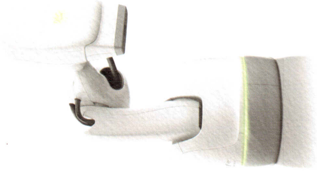
CyberKnife® M6™ Series System